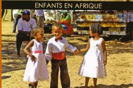
Exhibition in Paris