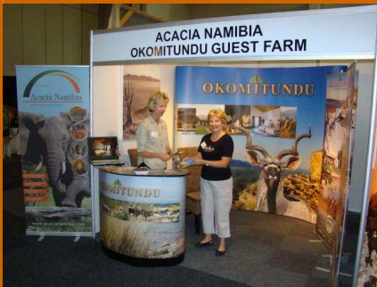
At the Destinations Expo