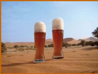
Camelthorn wheat beer