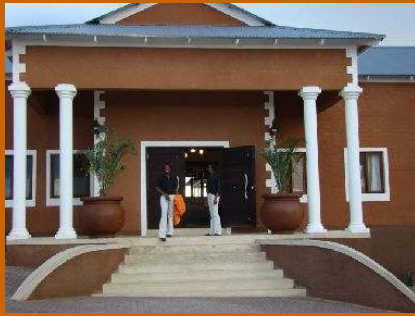
River Crossing Lodge