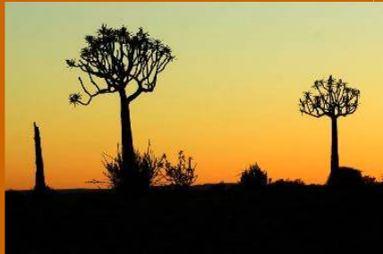
Quiver trees at Gondwana Nature Reserve