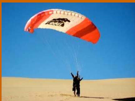
Free like a bird...