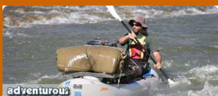
The way of a canoe...