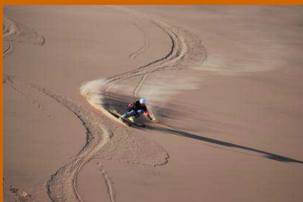
Sand instead of snow