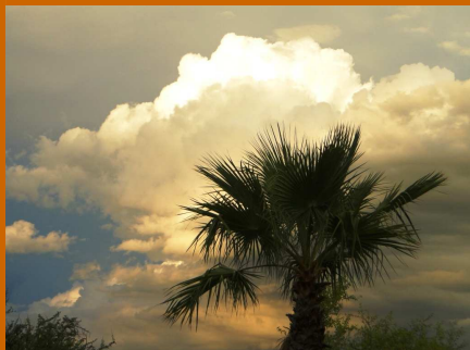
Rainy season in Namibia