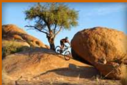
Mountain biking in awesome areas