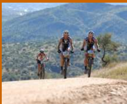
Mountain bike race