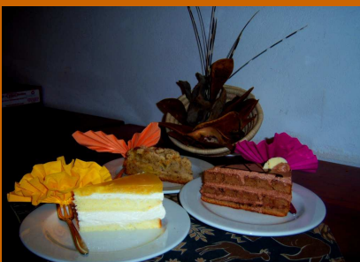
and the variety of cakes