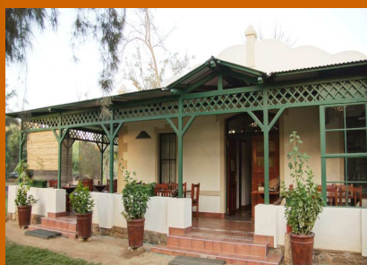
Goanikontes Oasis – veranda