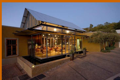
Fresh 'n Wild frontview...