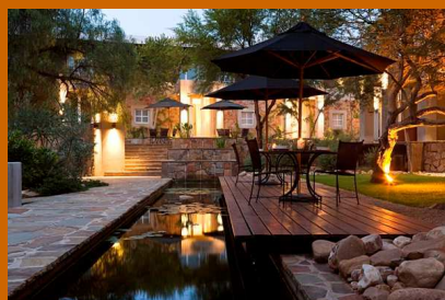
...and from the back