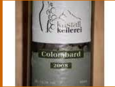
One of the famous wines