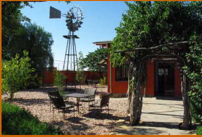
Altes Farmhaus, outside...