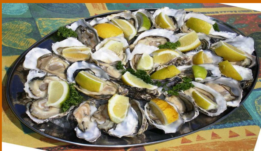
Fresh Namibian Oysters