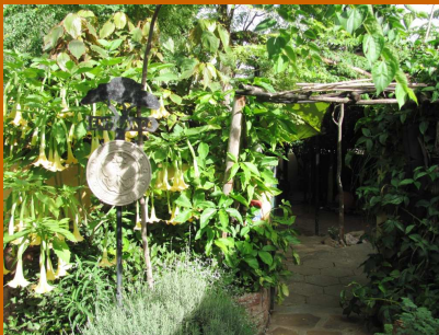
Kameldorn Garten entrance

More information: +264 64 570 083 or http://kristallkellerei.wordpress.com