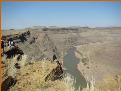
Fishriver- Horseshoe Canyon

acacia@iway.na www.acacianamibia.com Windhoek Namibia Tel: +264 61 229142 Fax: +264 61 229125