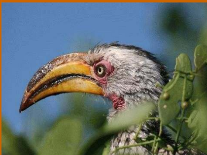
Yellow billed hornbill

Did you know that in the Etosha National Park, there are no baboons, hippo, crocs or buffalo present ?